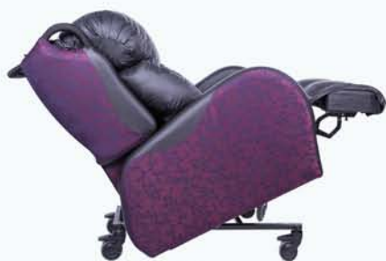
Tilt in Space